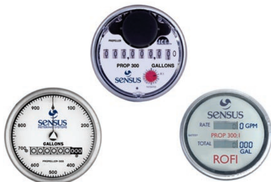
Standard Sealed Register

150 psi (10 bar) Working Pressure, 300 psi (20 bar) Working Pressure, Magnetic Drive Sealed Gear Housing, Sizes 4" through 36" (DN 100mm—DN 900mm)